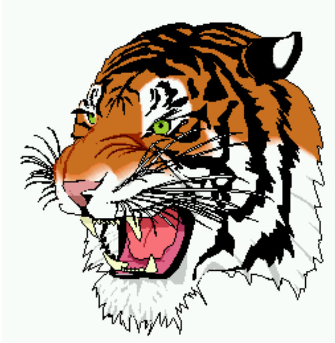
Figure 1. Tiger block image